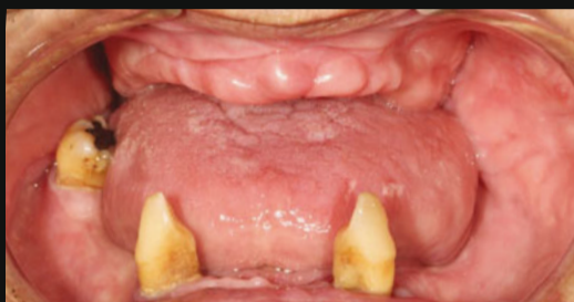
b) Intra-oral without prostheses