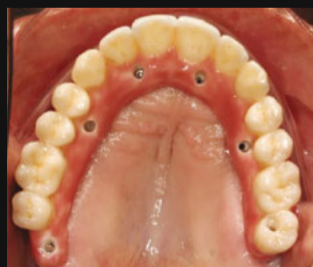
Fig. 12- Upper prostheses (occlusal)