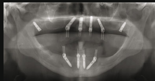
c) Immediate function X-ray

DISCUSSION: The loss of teeth promotes bone resorption at the level of the jaw. A implant-supported full rehabilitation allows the placement of implants and respective immediate loading. Because of being a simple surgical technique and prosthetic, and have a high success rate, the complete implant rehabilitation is increasingly used.