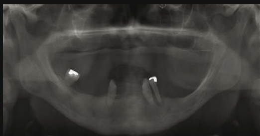
Fig. 1 - Inicial photos a) Inicial panoramic X-ray

6 implants were performed in the upper jaw and 4 implants in the lower jaw with immediate load (all of them Branemark System MkIV 4X15mm). The upper posteriors implants, due to poor primary stability, were loaded after the osseointegration period.