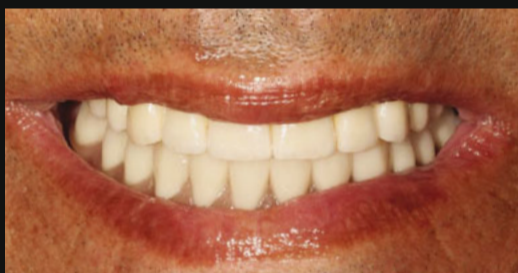
Fig. 6 - Ceramic try-in (smile)