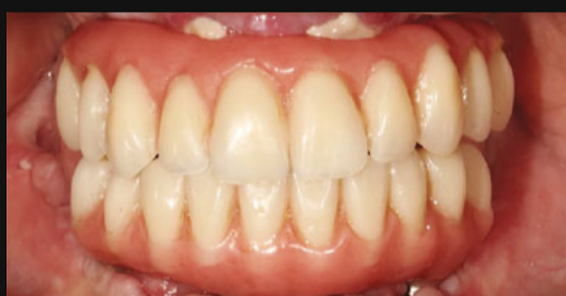
Fig. 2 - Provisional prostheses 10 days after surgery

DISCUSSION: The loss of teeth promotes bone resorption at the level of the jaw. A implant-supported full rehabilitation allows the placement of implants and respective immediate loading. Because of being a simple surgical technique and prosthetic, and have a high success rate, the complete implant rehabilitation is increasingly used.