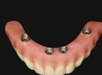
Fig. 14- Lower prostheses