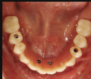
Fig. 13- Lower prostheses (occlusal)