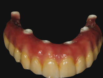
Fig. 11- Upper prostheses