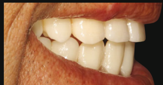
Fig. 7 - Ceramic try-in profile photo

CONCLUSION: The total rehabilitation on implants shown to be effective in surgical, prosthetic and biomechanical terms, bringing comfort, aesthetics and function to the patient.