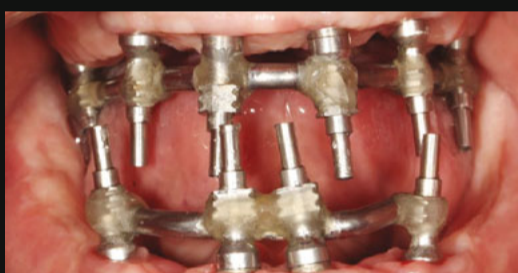
Fig. 3 - Final impression