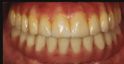
Fig. 10- Definitive prostheses (intra-oral)