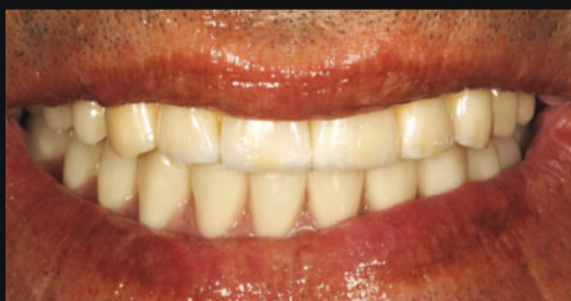
Fig. 9 - Smile with definitive prostheses