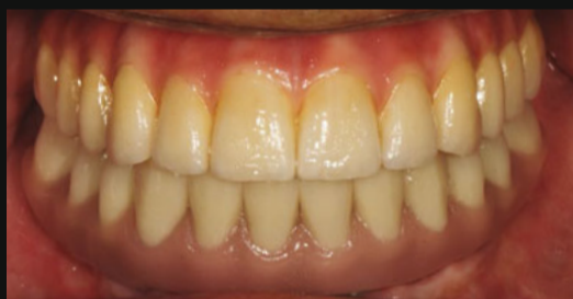
Fig. 5 - Ceramic try-in