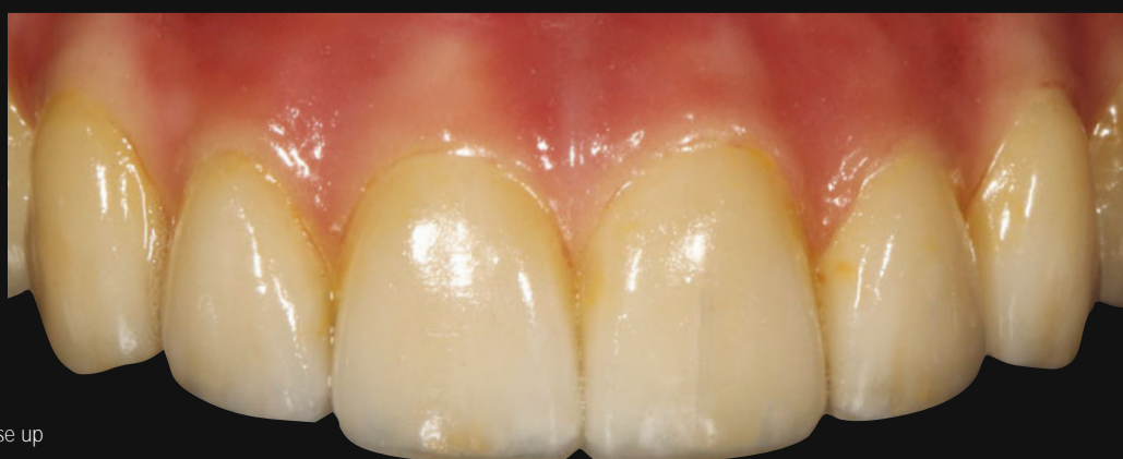
Fig. 15- Final close up