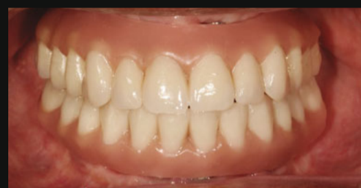
Fig. 4 - Esthetic try-in