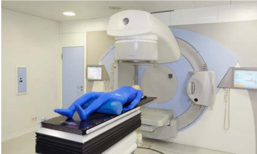
Figure 2 Design of a modern linear accelerator that can be used for the irradiation of malignant and non-malignant diseases.