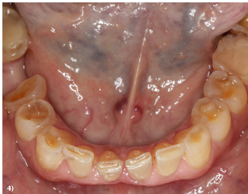
Figures 2–4 Patient case; the patient was examined before the start of treatment using the TWES. For the maxilla, a value of 4 was recorded for all 3 sextants (2nd sextant, palatal 3). In the mandible, a value of 3 in 4th and 6th sextants and a value of 2 for the 5th sextant was recorded.