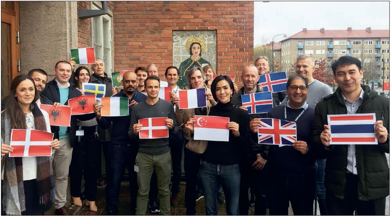
Series 4 participants during module in Malmö, Sweden.

“The tasks were not too difficult or time-consuming, and you can do your prelearning in your own time,” says Ikram. But he stresses the importance of completing the clinical cases in between the learning modules. Morley agrees, “You needed the time between visits to absorb and implement the learning and perform your own cases.”