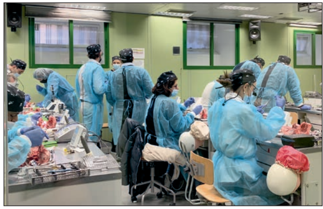
Module at University of Madrid, Spain – Hands-on training.