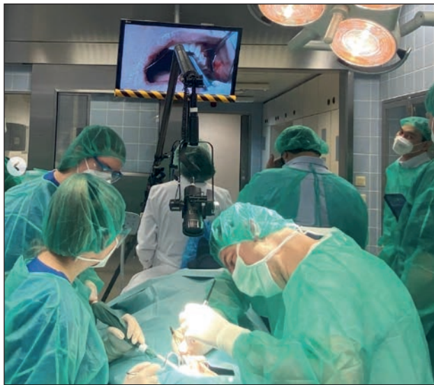
Module at University of Frankfurt, Germany – Live surgery.