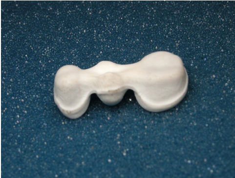
Fig. 5: Sandblasting of the restoration