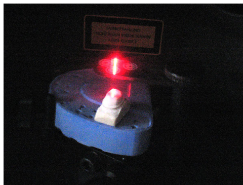
Fig. 2: Scanning of a die