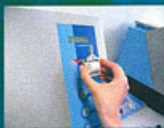
Fig. 5. Scanning of the pre-sintered soft prefabricated zirconium oxide block.

Material and method: There are two possibilities for producing frameworks: one is the classical method where the wax-up (Fig. 1) is scanned with Cercon brain scanner (Fig. 2) and the other is the virtual design. In the last case data captures from models were made using a 3D laser scanner Cercon Eye, with a precision down to the \mu\text{m} range (Fig. 3, 4). The scanner is an integrated part of the CAD/CAM system and operates only in combination with the dedicated soft Cercon art 2.2. It calculates the magnification factor and controls the conversion in the milling program. The virtual 3D dental restorations were designed on the computer screen following the specific steps. The CAD software transforms the virtual model into specific set of commands which drive the CAM unit. CAM complete oversized restorations were created by subtraction from pre-sintered soft prefabricated zirconium oxide blocks (Fig. 5, 6, 7), processed and finally these were sintered and reduced to the original size (Fig. 8, 9, 10).