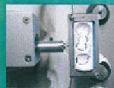
Fig. 6. Oversized milled restorations.

Material and method: There are two possibilities for producing frameworks: one is the classical method where the wax-up (Fig. 1) is scanned with Cercon brain scanner (Fig. 2) and the other is the virtual design. In the last case data captures from models were made using a 3D laser scanner Cercon Eye, with a precision down to the \mu\text{m} range (Fig. 3, 4). The scanner is an integrated part of the CAD/CAM system and operates only in combination with the dedicated soft Cercon art 2.2. It calculates the magnification factor and controls the conversion in the milling program. The virtual 3D dental restorations were designed on the computer screen following the specific steps. The CAD software transforms the virtual model into specific set of commands which drive the CAM unit. CAM complete oversized restorations were created by subtraction from pre-sintered soft prefabricated zirconium oxide blocks (Fig. 5, 6, 7), processed and finally these were sintered and reduced to the original size (Fig. 8, 9, 10).