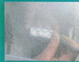
Fig. 10. Sandblasting of the restorations.

Conclusions: Handling with Cercon CAD/CAM system is easy for the practitioner. It is important that the user can modify the automatically designed restorations and individualize them to each clinical case.