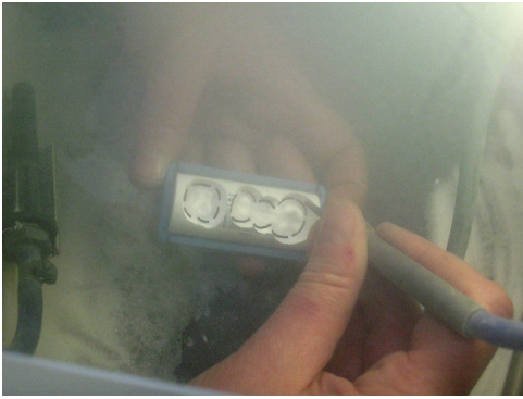
Fig. 3: Scanning of the presintered soft prefabricated zirconium oxide block