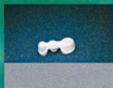
Fig. 9. Final sintered restorations.