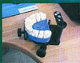
Fig. 3. Cast prepared for scanning.