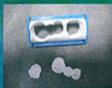
Fig. 8. Oversized restorations.