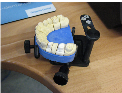
Fig. 1: Cast prepared for scanning

Data capture from models were made using an 3D laser scanner Cercon Eye with a precision down to the \mu\text{m} range (Fig. 1, 2). The scanner is an integrated part of the CAD/CAM system and operates only in combination with the dedicated soft Cercon art 2.2. It calculates the magnification factor and controls the conversion in the milling program. The virtual 3D dental restorations were designed on the computer screen following the specific steps. The CAD software transforms the virtual model into specific set of commands which drive the CAM unit. CAM complete oversized restorations were created by subtraction from presintered soft prefabricated zirconium oxide blocks (Fig. 3, 4), processed and finally these were sintered and reduced to the original size (Fig. 5, 6, 7).