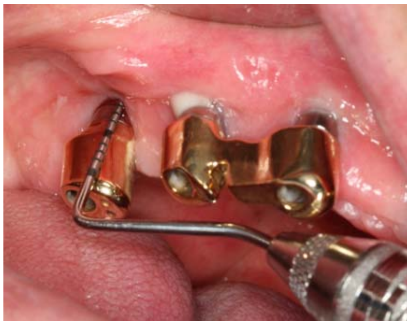
Fig. 1-3: J. P. Woelber

Figure 3 Clinical image showing the outflow of pus at site 15 after probing in the same smoking patient.