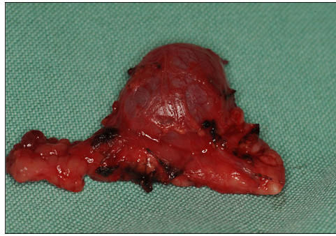
Fig. 3: Resection specimen