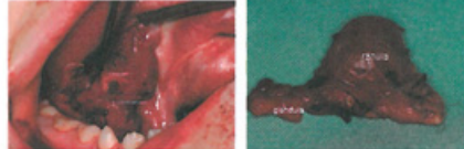
Original ranula excised together with ipsilateral sublingual gland

Retrospective patient file analysis of treated cases between 1993 and 2010.