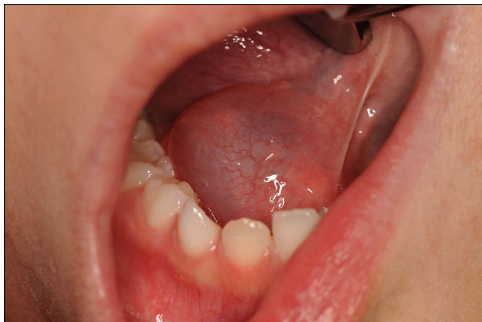
Fig. 1: Clinical presentation