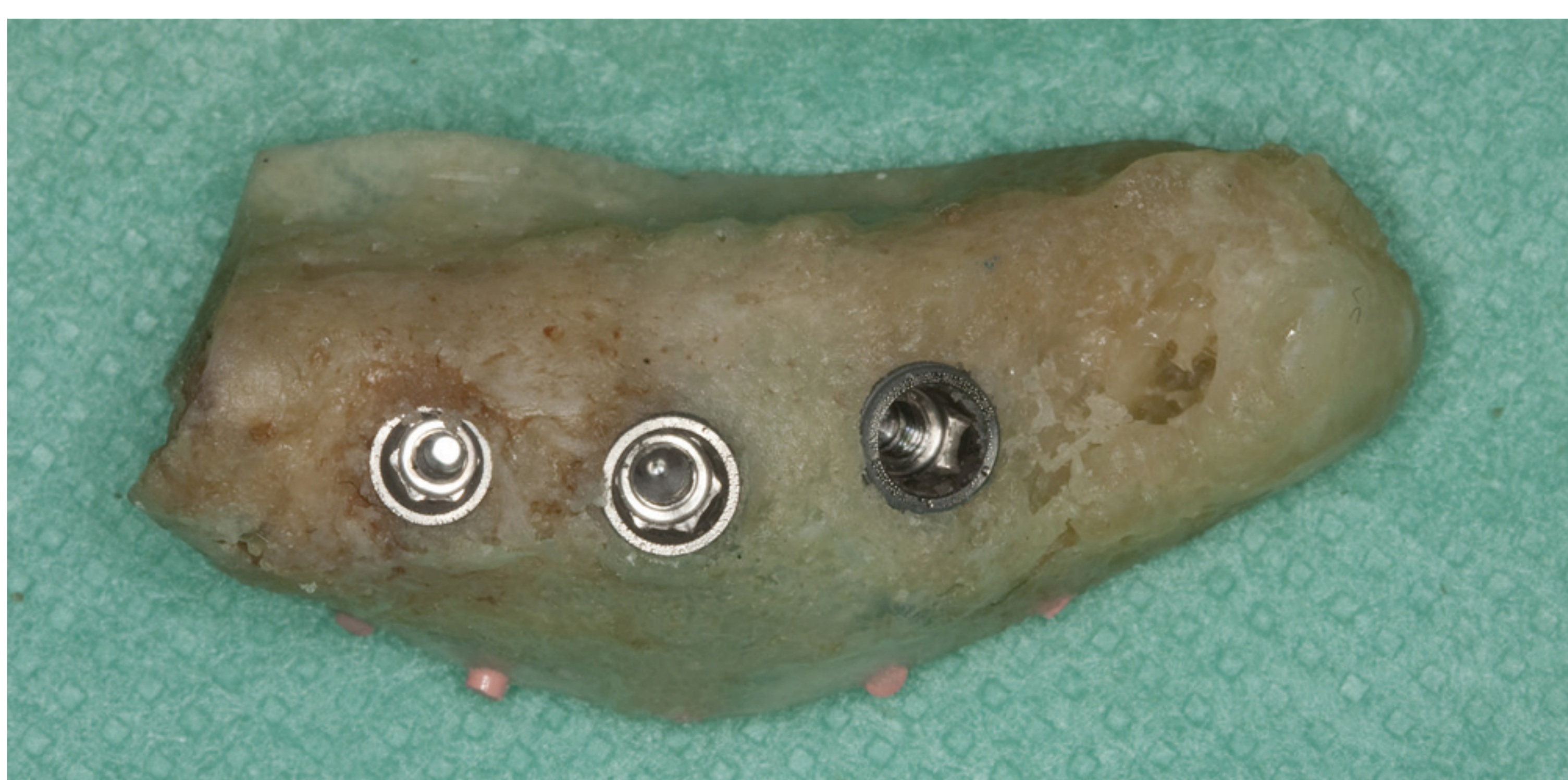
Three implants of 3.5 mm, 4.3 mm and 5.0 mm diameter were placed in each maxillary sinus floor (residual bone height 2-6 mm): crestal (a) and apical (b) view of harvested specimen.

Significant (*) impact of bone density on primary implant stability (ITV) was consistently observed in residual alveolar bone of 2 to 6 mm height, while no correlation (rs) regarding implant diameter could be found.