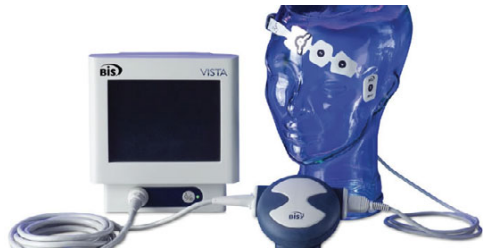
Figure 2: BIS monitoring equipment

The bispectral index (BIS) interprets electroencephalographic activity and may be used to predict level of sedation and loss of consciousness in both general anaesthesia and sedation. It can be used to measure the level of responsiveness of a patient and predict the loss of consciousness 5 . A BIS value of 90-100 is an awake state; 71-90, light to moderate sedation; 61-70, moderate sedation and 45-60, hypnosis suitable for surgery 6 . An electroencephalogram is detected utilising three electrodes placed on the frontotemporal region. The analog signal is then digitised and filtered and the signal mathematically processed with bispectral analysis 7 .