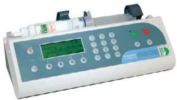
Figure 1: Graseby® Diprifusor pump

Propofol is a short acting hypnotic agent and has many uses both in sedation and general anaesthesia. In sub-anaesthetic doses it has useful sedative and anxiolytic properties 1 . It may be administered by continuous infusion or by Target Controlled Infusion (TCI) systems. The TCI infusion pump incorporates a pharmacokinetic model to calculate and deliver enough propofol to maintain a stable concentration of drug in a patient and maintain an optimum level of sedation 2 . The anaesthetist administering the drug uses a TCI (target controlled infusion) pump which adjusts the rate of delivery according to a pharmacokinetic/pharmacodynamics model 3 , of which there are several models which have been shown to be clinically effective 4 .