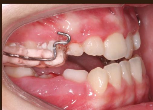
Figure. 1 Mcnamara appliance