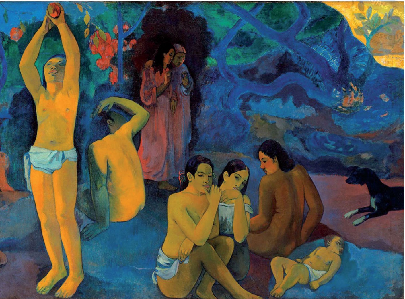
Where Do We Come From? What Are We? Where Are We Going?

The possibility of linking dental prostheses to the facial skeleton via an implanted device had been conceived as a way of overcoming the manifest disadvantages of conventional prosthodontic treatment, especially removable prostheses. Despite numerous pioneering efforts over many decades, predictable time-dependent and morbidity-free documented outcomes proved to be elusive until the publication of Per-Ingvar Brånemark's seminal research on the technique of osseointegration. The ability to safely locate alloplastic tooth roots in the jaw bones had finally become a reality! In 1982, the Toronto Conference on Tissue-Integrated Prostheses introduced to the broader dental academic community in North America the concept of inducing a controlled interfacial osteogenesis between dental implant and host bone. This was soon followed by an endorsement from international