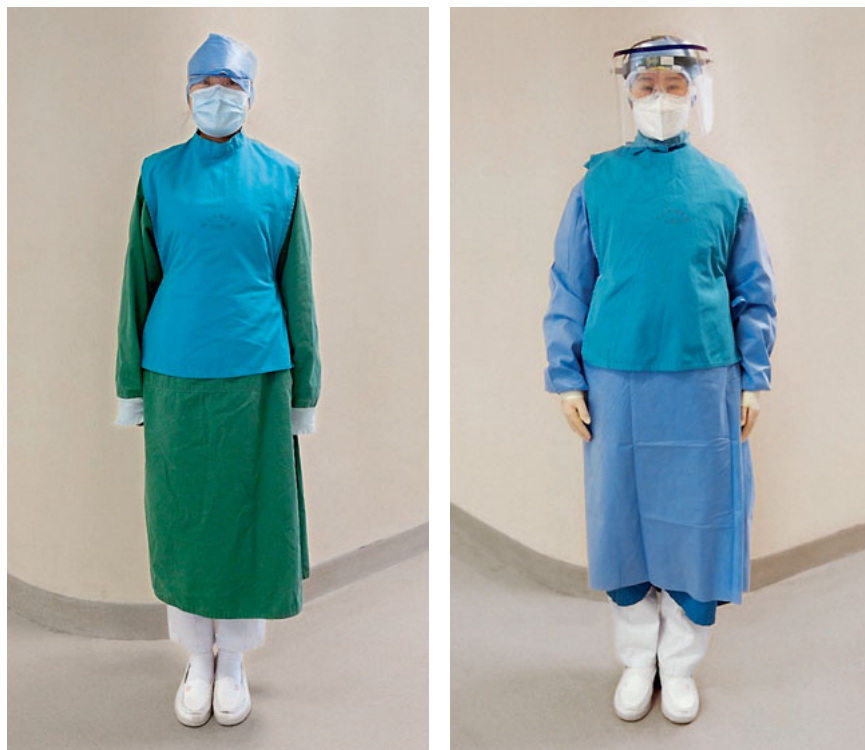
Fig 2 PPE for operations without splatter or aerosols in second-level protection, and reusable non-fluid-resistant fabric gowns and dickeys (left).