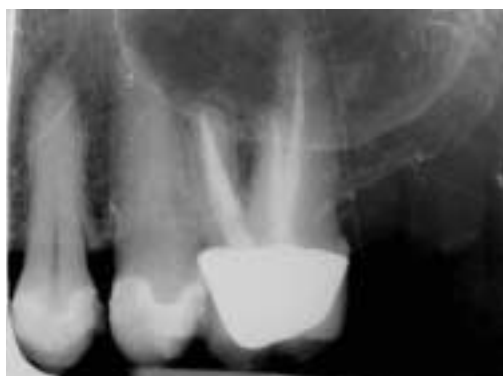
Fig 9 Periapical radiograph after 34 months.