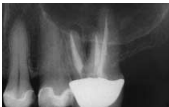
Fig 3 Diagnostic radiograph of tooth 26 before retreatment.

When the patient presented herself, she was in severe pain. The tooth was sensitive to percussion. A diagnostic radiograph showed a radiolucent area around the mesio-buccal root and in the furcation area distal to the mesio-buccal root (Fig 3). It was not possible to probe the furcation. A diagnosis of symptomatic apical periodontitis was made, which might be caused by an untreated second mesio-buccal canal and a strip perforation in the mesio-buccal root.