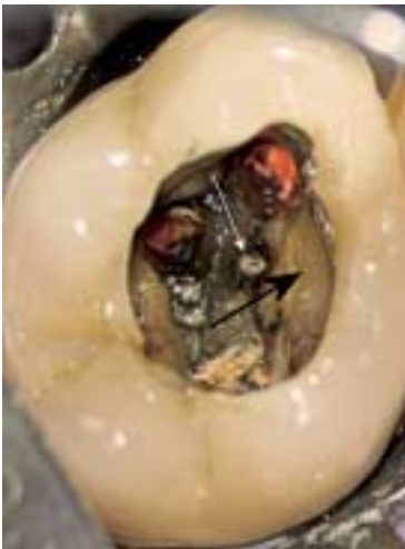
Fig 4 Existing perforation in the floor of the pulp chamber (white arrow) and the incompletely removed roof of the pulp chamber (black arrow).