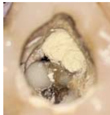
Fig 7 MTA was placed on the strip perforation.

A post-treatment radiograph was taken (Fig 8). The patient was referred to her own dentist for a definitive coronal restoration.