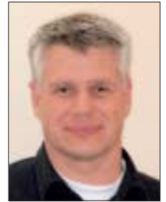
Andreas K Braun Department of Cariology Endodontology Paedodontology, ACTA, Amsterdam, The Netherlands

Key words location, mesio-buccal root, strip perforation