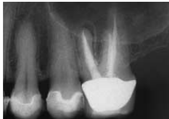
Fig 8 Periapical radiograph after retreatment.