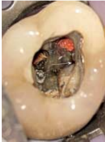
Fig 5 Second mesio-buccal canal (white arrow).