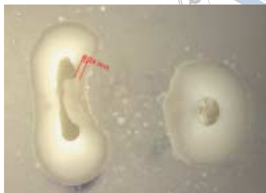
Fig 2 Cross section of the same mesial root shown in Fig 1, after preparation that caused a thinning of the distal aspect of the root.

a porcelain bonded to metal crown. At that time, the diagnosis was a symptomatic irreversible pulpitis. Three root canals had been located and chemo-mechanical preparation of these canals had been performed using rubber dam for tooth isolation. Thereafter, the patient had been free of symptoms until now.