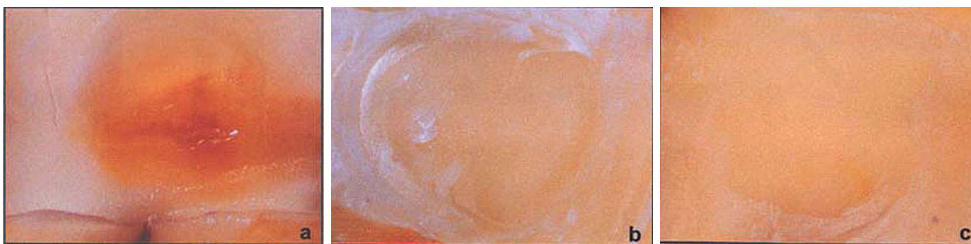
Figure 3a. Fracture surface from shear bond test with SB Bond showing cohesive failure in CAD

In general, a greater percentage of the fractures were adhesive at the tooth-composite junction. The fracture patterns of the specimens of the materials involved are given in Table 3. The macroscopic mode of failure for bonding systems SB, OCB, PB and EP appeared to be adhesive in nature. That is the bond failed in the dentin/composite interface. With system CSE, most of the failures appeared to be cohesive failure of the composite and dentin, although about 33% of the bond failures showed some adhesive failure and about 21% of the bond failures showed some mixed failure (Figure 3a, b, c).