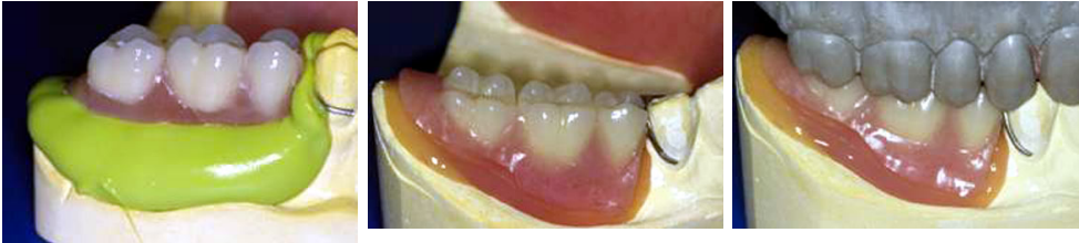
Fig.10,11,12: Indirect, laboratory relining; Direct, mouth open relining; Direct, mouth closed relining from left to right