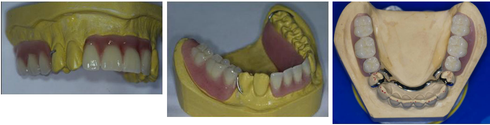
Fig.7,8,9: Processed dentures before relining