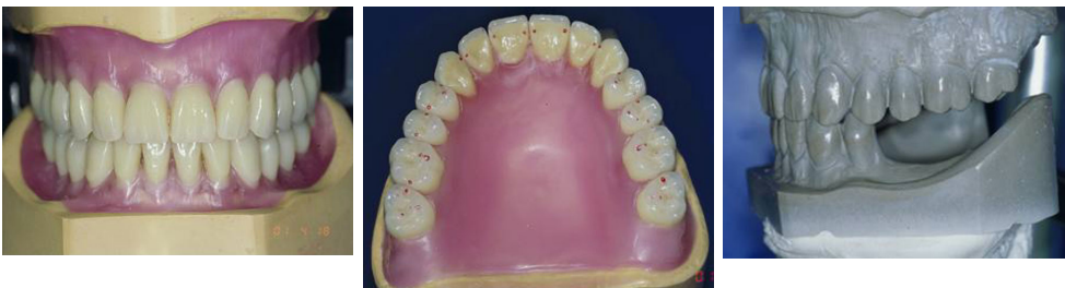
Fig.1,2,3: Set up of Premium teeth®, acrylic master model

The in vitro study comprised interim dentures in the maxilla, interim dentures and RPDs in the mandible Premium teeth®, Versyo.com® : Heraeus-Kulzer. Each of the three dentures was relined with a lightcuring relining material Versyo.com HD®, Heraeus-Kulzer ten times in the indirect technique, five times in the direct mouth open technique and five times in the direct mouth closed technique. Occlusal contacts of a total of 60 relinings were documented before and after relining. For the descriptive statistical analysis of the occlusal contacts 0= no contact, 1= contact the program Microsoft® Excel 97 SR-1 was used.