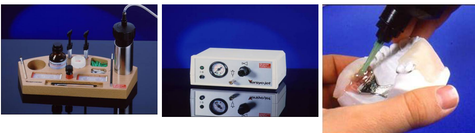
Fig.4,5,6: Versyo.com Hd® cartridge system, lightcuring resin for RPDs