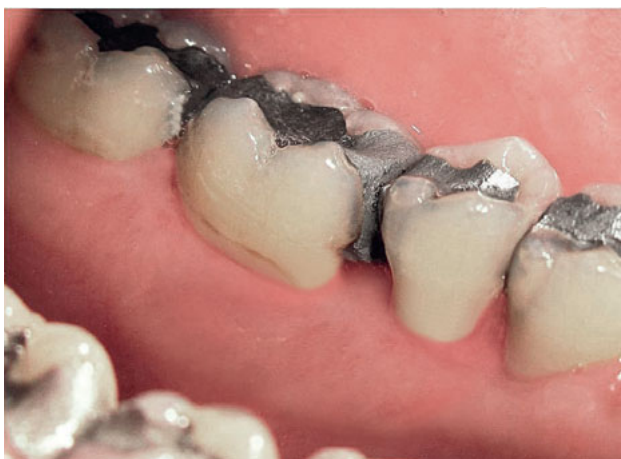
Fig 7 Postoperative photograph after 1 year.