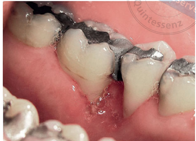
Fig 6 1-week postoperative photograph following suture removal.