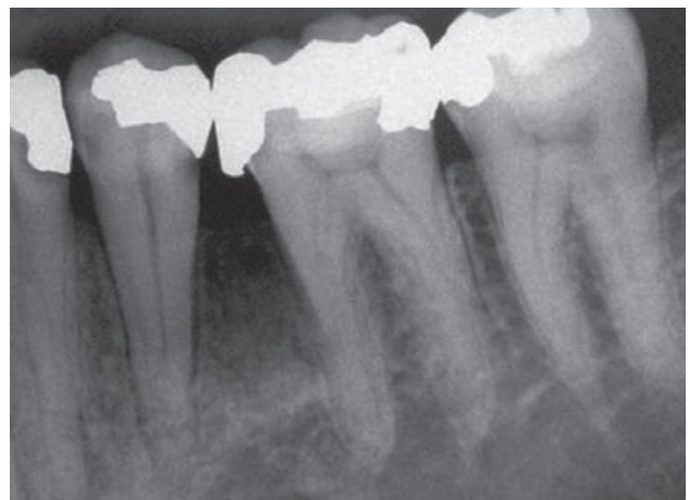
Fig 8 1-year postoperative radiograph showing adequate bone fill between teeth 35 and 36.

hyperactivity theory. Among them, the dental lamina hyperactivity theory is the most accepted. This states that an additional tooth bud may be induced to develop from remnants of excessive dental lamina or palatal extensions of the active dental lamina, resulting in a supernumerary tooth 5 .