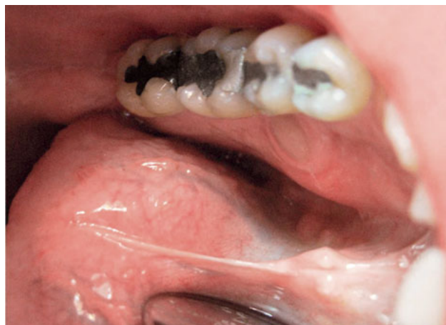
Fig 1 Preoperative clinical photograph showing exposed cusp of supernumerary teeth between teeth 35 and 36.