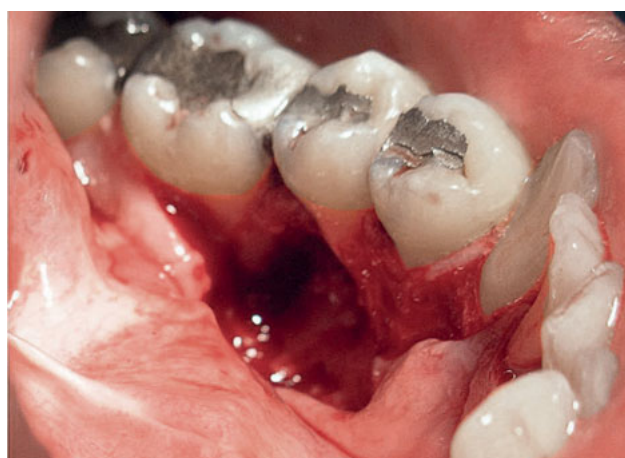
Fig 3 Bony defect after removal of supernumerary teeth.