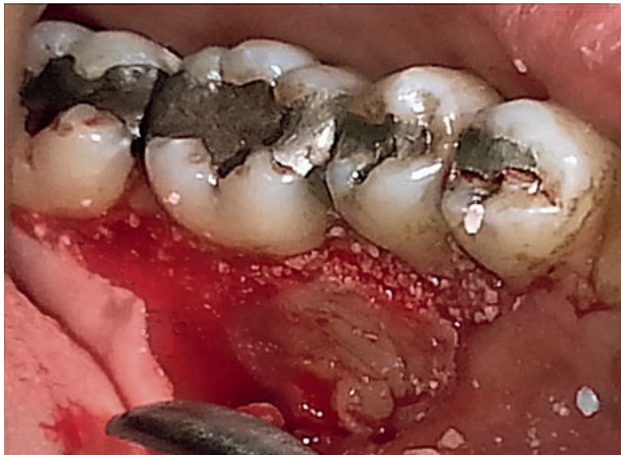
Fig 5 Clinical photograph showing filled bone defect with a combination of bone grafts and platelet-rich fibrin.