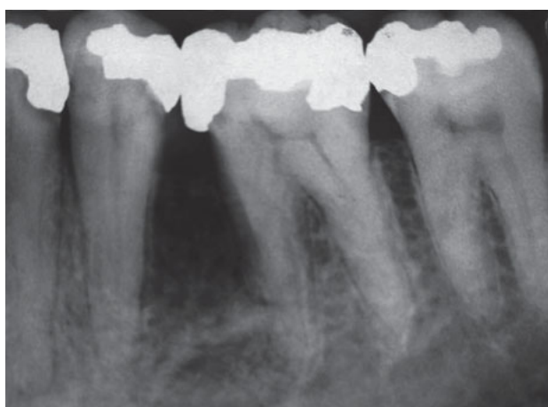
Fig 4 Periapical radiograph showing bone defect between teeth 35 and 36.

no pathological changes associated with teeth 35 and 36, surgical removal of supernumerary teeth was planned. Under local anaesthesia (LA), a mucoperiosteal flap was raised lingually and teeth were surgically removed, leaving behind a large bony defect. Bony dehiscence was observed in relation to the lingual aspect of tooth 35 and the mesio lingual aspect of tooth 36 (Figs 3 and 4). A combination of bone grafts (autograft, allograft (Puros, Zimmer Dental, CA, USA), xenograft (Osteobiol-Gen Os, Tecness Dental, Torino, Italy) and platelet-rich fibrin (PRF) was planned to augment the bony defect. Autograft was harvested from tori present below the bony defect site. The patient had 5 ml of his blood taken through an IV cannula and centrifuged at 2700 rpm for 13 min to obtain PRF. Bone grafts were placed into the defect and