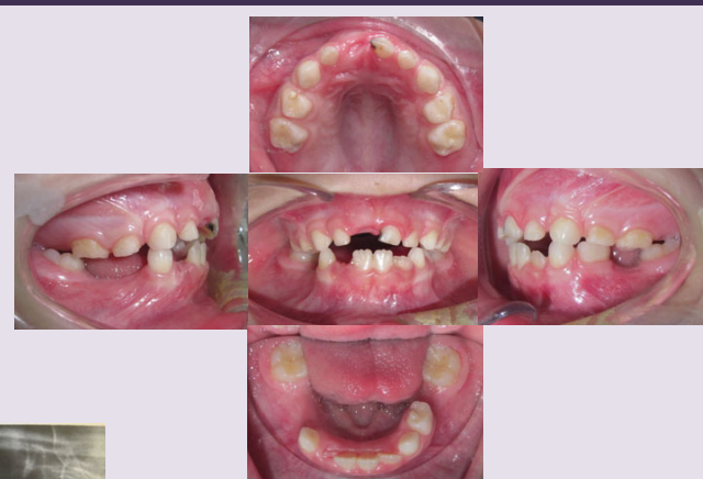
Intra and Extra oral photo and diagnosis exam.