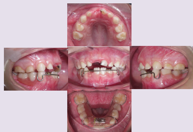
Intra and Extra oral photo with a removable space maintainer.