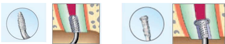
Abb. 1: schematic view of the preparation of the retrograde cavity with diamond-coated sound tips

A total of 135 human single-rooted teeth were filled with gutta-percha after endodontic treatment. The specimens had been randomly assigned to one of nine series (n=15). Specimens without retrograde root filling were used as control group. The other specimens were divided into two subgroups according to the sonically supported retrograde preparation form (parallel or retentive preparation) which contain four material groups in each case (Biodentine™, Pro Root™ MTA, Super-EBA®, Ketac fil™ Plus Aplicap). Afterwards three histological cuts were prepared at 1 mm, 2 mm, and 3 mm distance from apex. The following criteria were examined using an optical microscope (5x zoom): imperfect margin, maximal marginal gap, and the number of air pockets in each section.