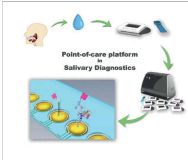
Fig 1 Illustration of the point-of-care platform for salivary diagnostics. The process requires that the saliva sample is put directly on the sensor cartridge; the on-site multiplexing detection of different types of biomarker is then carried out on the same chip.

status is a complex system, with time-dependent dynamics; presymptomatic indicators are useful for early detection, accurate diagnosis and developing therapeutic strategies 11-13 . Such biomarkers provide a ‘signature’ of the health state; they are found in biological fluids, such as blood and urine and, more recently, saliva. Saliva diagnostics utilises transcriptomic 5 , proteomic 14,15 , metabolomic 16,17 , microRNA 18,19 and microbiome 20,21 technologies to decipher the most discriminatory biomarker panel. The Human Salivary Proteome Project has discovered all salivary secretory proteome components, post-translational modifications and protein complexes and has compiled information on their structures and functions. The database is fully accessible and available to the public ( http://www.hspp.ucla.edu ). Recently, the salivary transcriptome, including messenger RNA (mRNA), genomic DNA (gDNA) 5 , micro RNA (miRNA) 19 , microbiome 20,21 and metabolites 16,17 , has been shown to contain promising candidates for salivary diagnostics 4,18,19,22,23 . Other biomarkers in saliva, such as hormones, suggest additional applications for saliva as a valuable diagnostic fluid and offer the potential to identify disease in a non-invasive and specific manner 14,24-28 . Consequently, saliva provides a biomarker source for the monitoring of both oral and systemic health.