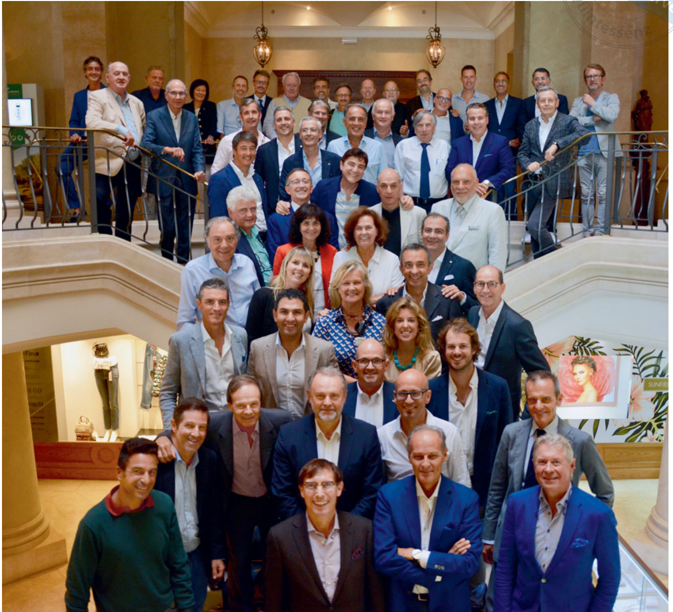
Members and faculty of the EAED Mallorca Autumn Meeting posing on the grand stairway of the Castillo Hotel Son Vida.