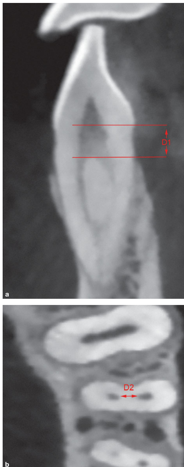
Fig 1 CBCT images of double root canals. (a) Distance between the CEJ and the root canal bifurcation (D1) in a sagittal section view of the double root canals. (b) Shortest distance in the transverse plane between the two canal orifices (D2) in an axial section view of the double root canals.

radiography, CBCT is very powerful for excluding the overlaps caused by other tissues and thus allows better observation of the 3D structure of the tooth 30,31 . Previous studies have demonstrated anatomical symmetry in the number of roots and root canal systems between bilateral homonym teeth 32,33 . However, these studies focused primarily on premolars and molars, and limited information is available on the root canal system in the mandibular anterior teeth.