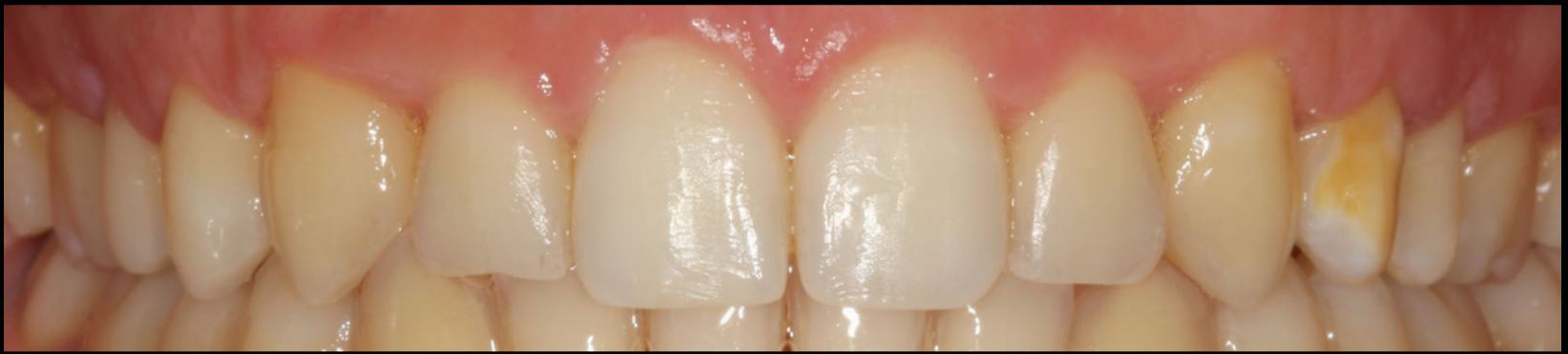
Fig. 1 - Initial intra-oral photo

CLINICAL CASE DESCRIPTION: Male patient, healthy, aged 23, previous orthodontic treatment, unhappy with the aesthetics of his smile (Fig. 1). Following anamnesis and a clinical and radiographic evaluation, multiple caries lesions, teeth showing amelogenesis imperfecta and an antero-superior diastema were diagnosed (Fig. 2 - 4). Treatment plan involved an at-home dental bleaching, the aesthetic restorative treatment with composite resin of the caries lesions and teeth with amelogenesis imperfecta as well as a ceramic mini-veneer to close the diastema between teeth 12 and 13 (Fig. 5 - 6).