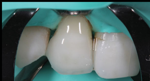
Fig. 9 - Photo immediately after cementation

CONCLUSIONS: Through this treatment, the rehabilitation of the function and aesthetics of the smile was possible (Fig. 12 - 14). Ceramic fragments are an excellent choice due to their minimally invasive procedure and highly esthetic results.