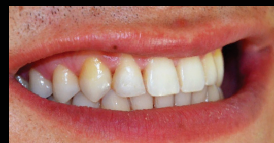
Fig. 14 - Final smile photo - 6 months follow-up