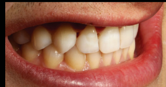
Fig. 11 - Extra-oral photo after cementation