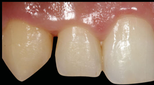
Fig. 3 - Initial Close-up