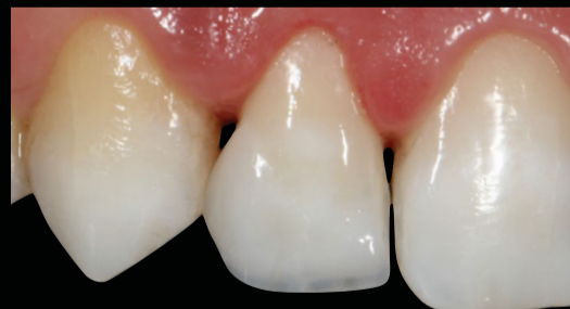
Fig. 10 - Close-up after cementation and removal of rubber dam