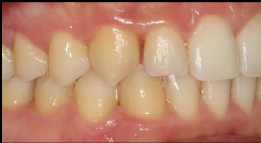
Fig. 2 - Initial intra-oral lateral photo