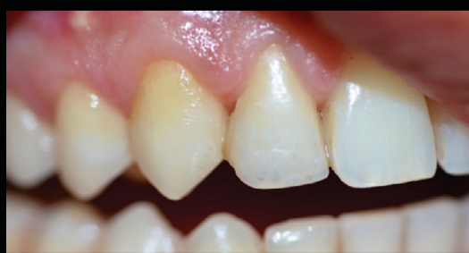
Fig. 12 - 6 months follow-up