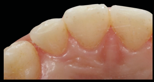
Fig. 4 - Intra-oral incisal perspective photo

DISCUSSION: Ceramic and composite are used in dentistry due to their ability in providing aesthetic results that mimic natural teeth. Ceramic is a biocompatible material, enabling the proper light reflection/ transmission (1) (Fig. 7). The cementation protocol is currently well documented (2) (Fig. 8 - 9). The correct treatment planning allows to maintain the color and shape stability (Fig. 10 - 11), displaying good mechanical strength when subjected to masticatory forces. (3).