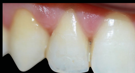
Fig. 13 - 6 months close-up follow-up