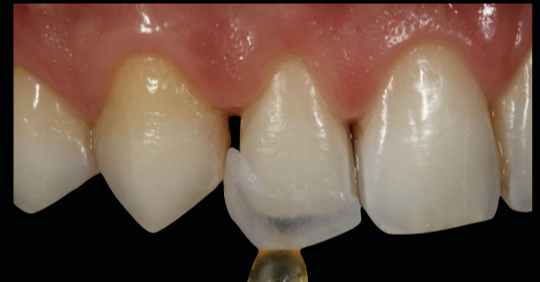
Fig. 7 - Try-in of the ceramic fragment