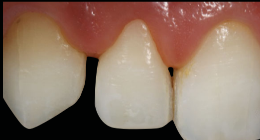
Fig. 6 - Cosmetic contouring