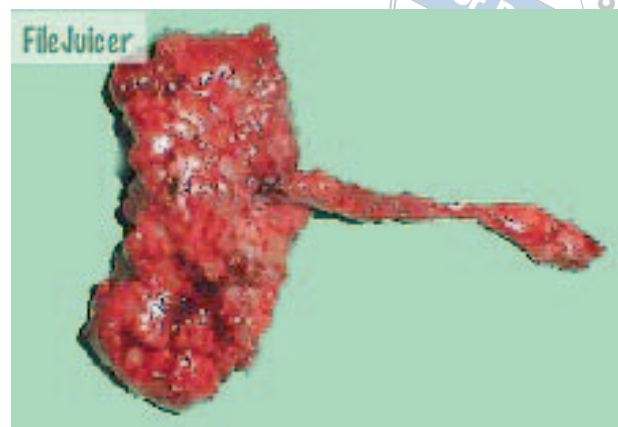
Fig 1b The superficial lobe of the parotid gland was removed with main duct.

ever, differences exist in the surgical characteristics and management of tumour versus non-tumour diseases.