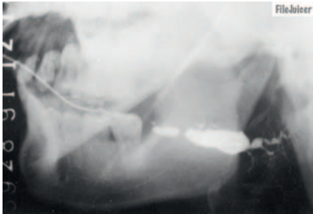
Fig 2 Sialograms showed that the main duct was severely dilated, extending to branching ducts with atrophy of acini.

with salty discharges as well as pus from the parotid ductal orifice when the parotid gland was milked. There was one case of pronounced symptoms, with parotid mass and without clear circumscription. No facial paralysis was reported prior to surgery.