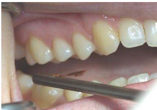
Figure 3a Experimental procedure for interocclusal tactile sensibility/active tactile sensibility: cheek retractors are used to retract the corners of the mouth and a test foil is inserted in the interocclusal space.