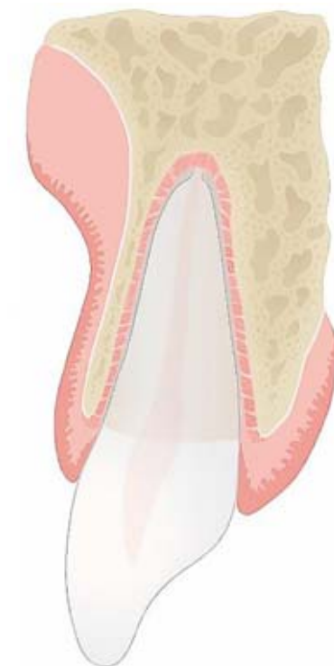
Figure 1 Schematic representation of a cross-section through a natural tooth together with periodontal tissue.

The recorded EMG reflex responses are reduced by approx. 90%