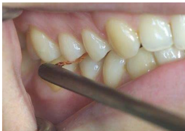
Figure 3b Test position: after the investigator's request, teeth clenching is performed by the subject.