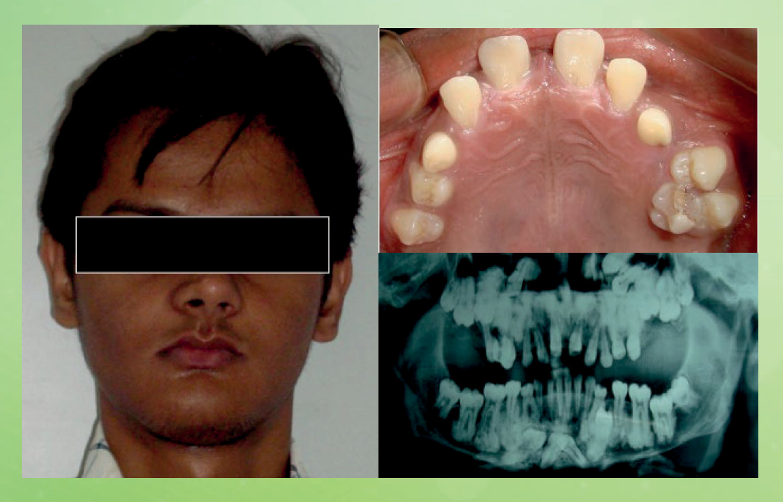
of familial FCOD was made.

28-year-old A male with spacing and malpositioned teeth. On extra-oral examination no abnormality was noticed except slight maxillary deficiency. Intraoral examination revealed a high frenum attachment between maxillary central incisors and missing 1st molars on both sides with a retained maxillary deciduous second molar on the left side.