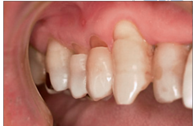
Fig 1 Typical angular lesion.