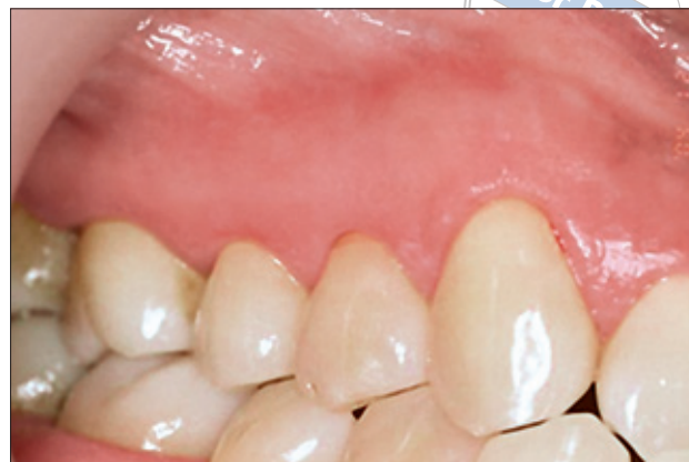
Fig 4 Typical early-stage cervical lesion in a first premolar in the maxilla.

Miura 25,26 reported more NCCLs on the left side among patients who handled their toothbrush using the right hand, and more NCCLs on the right side in patients who brushed with their left hand. If the force generated during brushing is important, then more lesions might be expected to occur on the side of the mouth opposite the hand holding the brush 27,28 . No such relationship between the right or left hands and