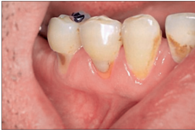
Fig 5 Newly developed cervical lesion at the gingival side of a resin composite restoration in a cervical cavity in a first premolar in the mandible.

NCCLs do not always occur exclusively on surfaces exposed to obvious physical factors, such as the abrasive action of brushing. Indeed, the present authors observed some lesions on the palatal and lingual surfaces of the teeth, where friction due to brushing was unlikely because of their inaccessibility. Sognaes et al 32 found that neither toothbrush nor toothpick friction alone could explain these cases.