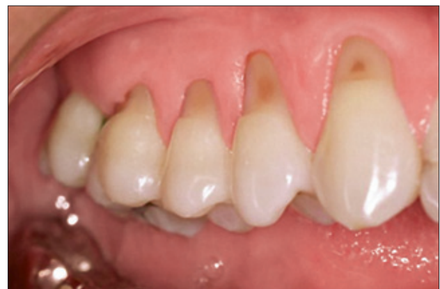
Fig 2 Typical saucer-shaped lesion.

*Significant ( P < 0.05 ) with other groups; #Not significant ( P > 0.05 ) within groups.