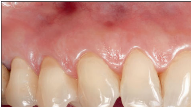
Fig 1 The 20-year follow-up of the clinical case originally published. Note the stability of the soft tissue coverage and the increase in keratinized tissue height. Some noncarious cervical lesions occurred. (Images reprinted with permission from: Zucchelli G, De Sanctis M. Treatment of multiple recession-type defects in patients with esthetic demands. J Periodontol 2000;71:1506–1514.)

a variety of surgical procedures that require flap elevation, such as: with periodontal reconstructive surgery to obtain an esthetic improvement along with periodontal regeneration; simultaneously with implant placement to improve soft tissue appearance; and for soft tissue augmentation in edentulous sites.