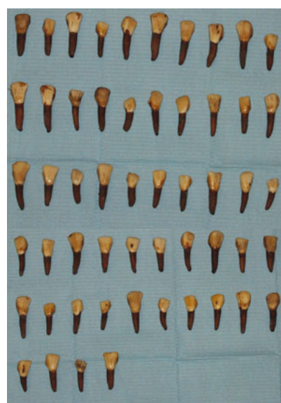
Figure 2: After dar photos (I-group 1; II-group 2)