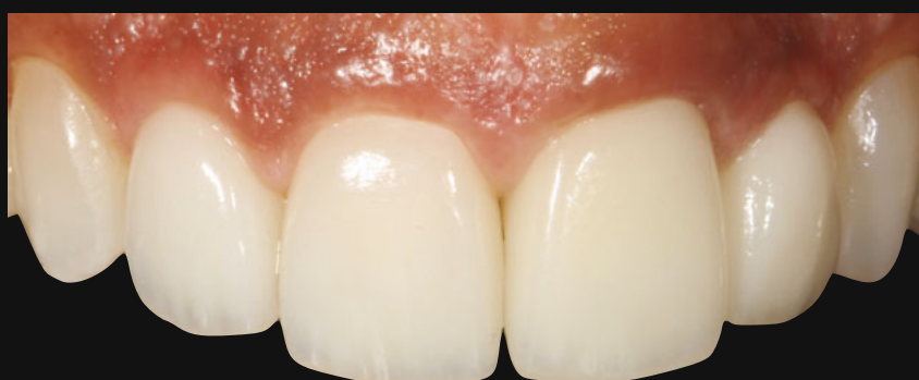
Fig. 17 - Final close-up