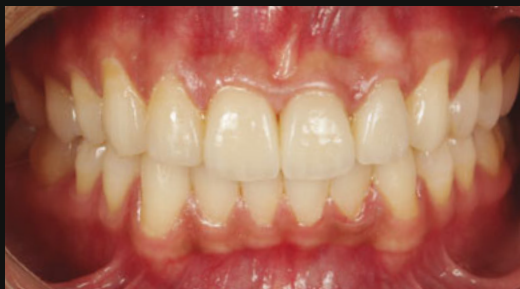
Fig. 11 - Final intraoral photo