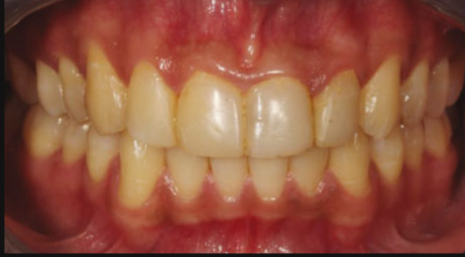
Fig. 2 - Initial intraoral photo