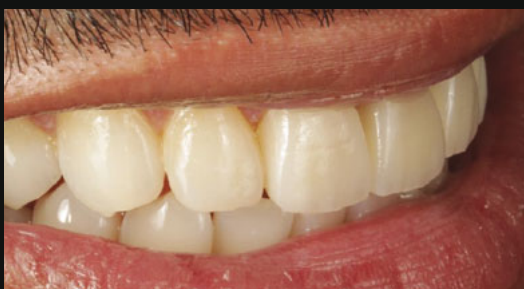
Fig. 13 - Final photo