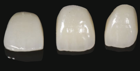
Fig. 12 - Feldspathic veneers of 11, 21 and 22