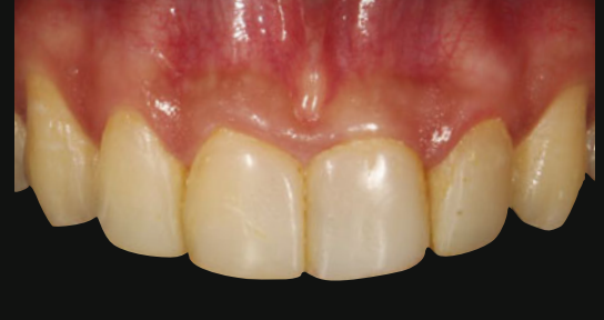
Fig. 3 - Initial close-up

DISCUSSION: With the development of adhesion, nowadays we have many materials and techniques for performing aesthetic restorations in the anterior sector. Indirect veneers and direct composite restorations are scientifically proved to be a very feasible option both aesthetically and functional. Both materials have biomimetic and biomechanical behavior similar to natural tooth, requiring minimally invasive preparations.