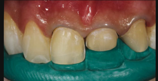
Fig. 6 - palatal matrix to control tooth preparation