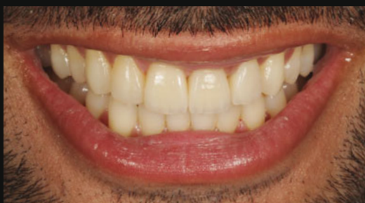
Fig. 14 - Final photo