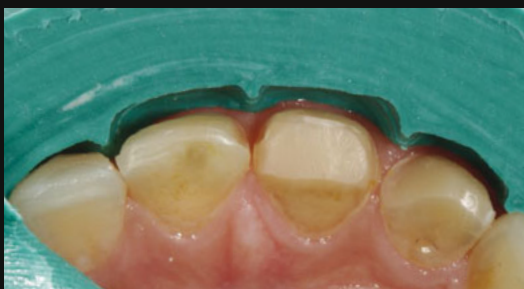
Fig. 7 - Buccal matrix to control tooth preparation