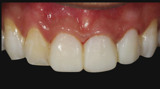
Fig. 8 - Provisional veneers of 11, 21 and 22 in bis-acrylic resin