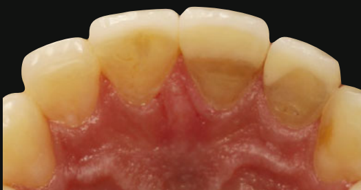
Fig. 10 - Final occlusal photo

CONCLUSION: Through the combination of different materials and techniques, it was possible to rehabilitate the function and esthetics of the smile, promoting a correct occlusal relationship. Both veneers and direct restorations present as an excellent alternative in such treatments as they allow highly esthetic and minimally invasive results.