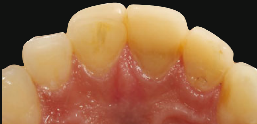
Fig. 4 - Occlusal after bleaching and new direct restorations

DISCUSSION: With the development of adhesion, nowadays we have many materials and techniques for performing aesthetic restorations in the anterior sector. Indirect veneers and direct composite restorations are scientifically proved to be a very feasible option both aesthetically and functional. Both materials have biomimetic and biomechanical behavior similar to natural tooth, requiring minimally invasive preparations.