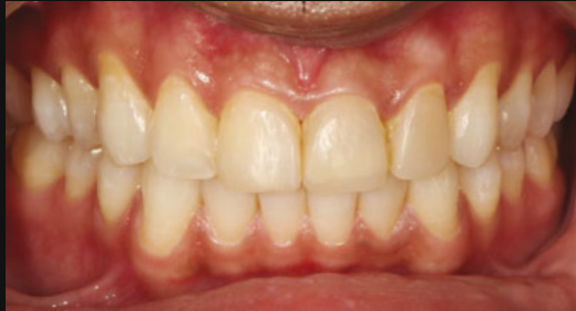
Fig. 5 - Intraoral after bleaching and new direct restorations