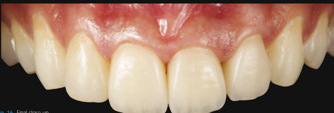
Fig. 16 - Final close-up