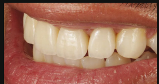
Fig. 15 - Final photo