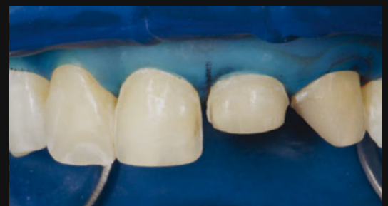
Fig. 9 - Rubber dam for adhesive cementation

CONCLUSION: Through the combination of different materials and techniques, it was possible to rehabilitate the function and esthetics of the smile, promoting a correct occlusal relationship. Both veneers and direct restorations present as an excellent alternative in such treatments as they allow highly esthetic and minimally invasive results.