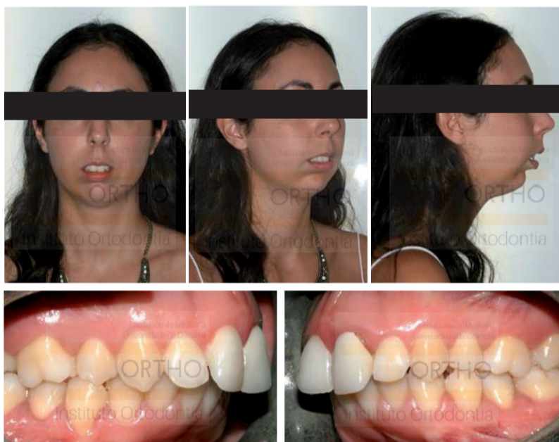
Fig.1- Initial photographs – extraoral and intraoral

Roth 0,018 prescription fixed appliances were placed to level the arches followed by the placement of the tooth-borne distraction osteogenesis device which was activated twice bilaterally every 12 hours. At the end of the distraction, 11 mm of mandibular lengthening were obtained. After this intervention the orthodontic treatment progressed in order to prepare the patient for a orthognathic surgery of maxillary impaction and mandibular repositioning. A significant improvement in the ANB angle was achieved from 16° to 4°. Despite the facial soft tissue improvement, the convex profile still didn't meet the patient's aesthetic expectations so, the patient was subsequently submitted to a genioplasty. Six months after the surgical procedures, the mandibular advancement remained stable and the patient reported a significant improvement in breathing and facial aesthetics, granting a better quality of life.