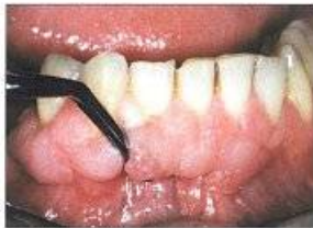
Figure 1: Vestibular view of the mandible, irregular granular growth with a rimose surface

Oral papillomatosis/condylomata acuminata (HPV subtype 6), by genitoanal-oral transmission.