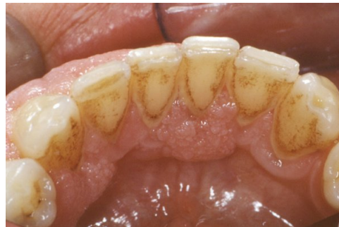
Figure 1: Vestibular view of the mandible, irregular granular growth with a rimose surface