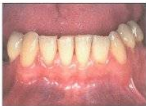
Figure 3: Vestibular view of the mandible, 24-month follow-up, complete remission