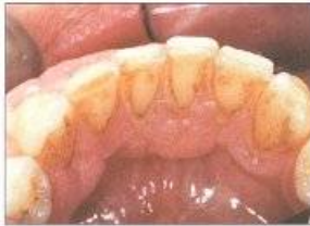
Figure 2: Lingual view of the mandible