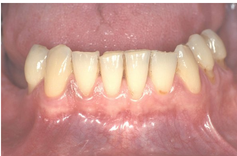
Figure 3: Vestibular view of the mandible, 24-month follow-up, complete remission

Therapy: With the patient's informed consent, we treated the lesions using a 5% imiquimod cream (Aldara®, 3M Medica) approved for the treatment of genitoanal condylomata acuminata. This preparation was applied without ablative pre-treatment, twice to three times a week, over a period of eight weeks. No adverse effects were noted during the treatment course. The preparation was well tolerated. Full remission was observed after eight weeks of treatment. No recurrence was seen within the subsequent 24-month period (Fig. 3).