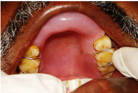
Fig 7: Post treatment

Patient was treated as in patient. During this course he had received the following treatment. It included, injection gentamycin 80mg bid, tab sparfloxacin 200mg od, tab amphoterecin B 25mg, tab fluconazole 150mg od and tab Dolo 650 tid. Patient was later followed up and after 3 months post treatment an obturator was constructed and patient was asked to continue the previous medication. Following this the patient came for a regular check up and healing was uneventful.