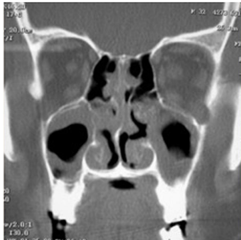
Fig 5: CT scan showing thickening of the sinus lining of soft tissue density (coronal view)