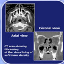
CT scan showing thickening of the sinus lining of soft tissue density