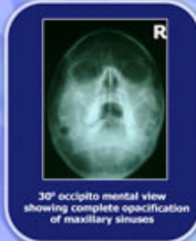
30° occipito mental view showing complete opacification of maxillary sinuses

FBS: 95mg% Hb: 11.2gm % Total count: 8000 cells/mm 3