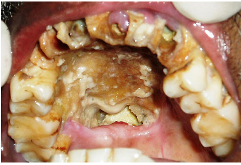
Fig 2: intra oral necrotizing ulcer