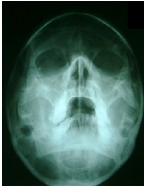
Fig 3: 30° occipito mental view showing complete opacification of maxillary sinuses