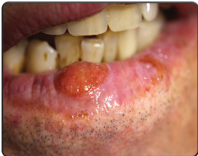
Photograph 1 – Vegetating aspect of the major and minor lesions

Man, 64 years old, retired (former doorman), come in office through the early intervention oral cancer (Portuguese) project [PIPICO] due to a lower lip lesion with 3 months of evolution without trigger or cure. He has no relevante medical history including beeign a non-smoker and very low alchool consumption. Throughout the clinical examination is observed a slightly elevated eliptic lesion, vegetating aspect, well defined limits, measuring about 0,9x07cm, hard at touch but not stone and non-bleeding despite the higly redish colour. No cervical adenopathy. The major lesion was excised (full excision). The suspicious diagnosis was oral squamous cell carcinoma. It was confirmed in the histological exam: squamous cell oral carcinoma moderately differenciaded without vascular ou nerve invasion. HPV infection was also tested and it was negative. After cirurgical intervention (cirurgical ward) in order to enlarge lower lip margins free of neoplasm cells was obtained samples free of malignant cells. The patient was redirected to the Family Phisician and apointed to regular follow-up routine.